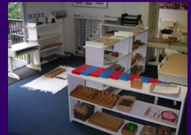
One of the classrooms at MMTTC-North Bay